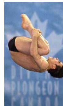
Current World Champion Alex Despatie of Quebec

Once you have mastered all five dives, you are ready to compete at a High Performance level. You will compete at Provincial, Western Canada, National and International Meets. You will be eligible to try out for Canada Games, Pan Am Games and World Championships. You will compete with others of the same age and will probably train for 15 hours per week or more. You will also take part in Training Camps, Sports Medicine Testings, and other Athlete Symposiums.